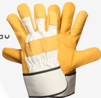
SI 1200 Y

SI 1200 Y Leather Palm gloves. High quality Cowhide grain leather Rubberized safety cuff and cotton cloth back Wing Thumb Elastic back for snug fit Finger and palm lined Perfect sizing according to EN-420 Standard Color :White/ Yellow / Red/Blue/Orange/ Green/Grey