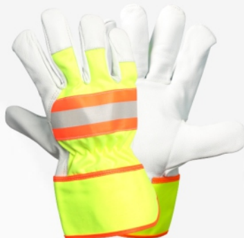
SI 1200 HI VIZ

SI 1200 HI VIZ Leather Palm gloves. High quality Cowhide grain leather Rubberized safety cuff and cotton cloth back Hi Viz protector knuckle Wing Thumb Elastic back for snug fit Finger and palm lined Perfect sizing according to EN-420 Standard Color :White/ Yellow / Red/Blue/Orange/ Green/Grey