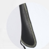
Rest Patch Kevlar Sewed