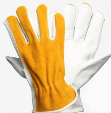
SI 1016 S

Driver Gloves. High quality Cowhide grain palm & Cow Split back Straight thumb Elastic back for snug fit Perfect sizing according to EN-420 Standard Color: Natural White/ Yellow / Beige.