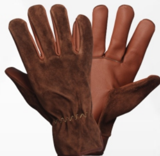
SI 1016 WR