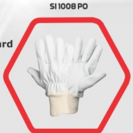
SI 1008 PO

CE Certified EN Standards Results EN ISO 21420:2020 EN-388:2019(EN-388:2016+A1:2018) 3122X CAT II