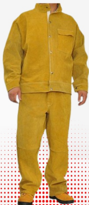
SJ 1500 ORG Front