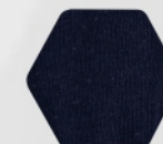
DuPont™ Nomex® Fabric built back