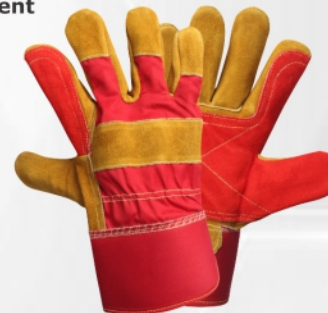
SI 1060 YR

SI 1060 YR Working gloves. High quality Cow Split leather Rubberized safety cuff and cotton cloth back Wing Thumb Elastic back for snug fit Perfect sizing according to EN-420 Standard Color :White/ Yellow / Red/Blue/Orange/ Green/Grey